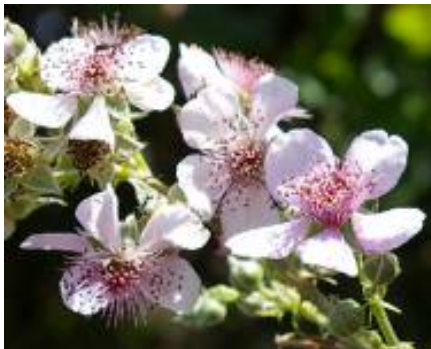
R. fruticosus - pink petals much longer than the sepals