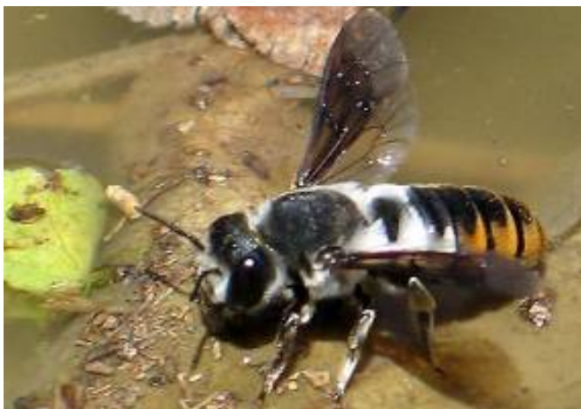
A leaf cutter bee that cannot be identified, because the taxonomic revision is not yet complete