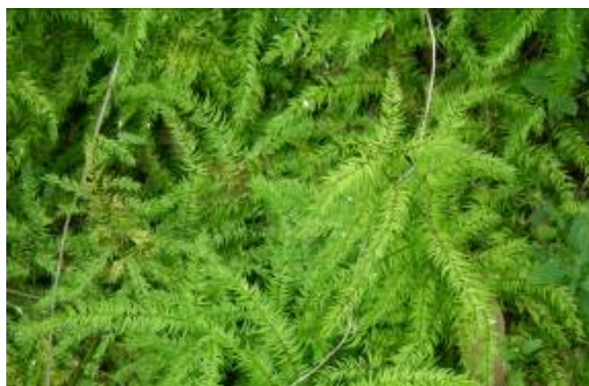
Long stems and leaf-like cladodes of Asparagus scandens (above), and A. scandens invading a forest in New Zealand (below)

Current control methods in New Zealand consist of manual and chemical control. Manual control involves digging up the whole plant, including the tubers, which makes it very labour intensive and also very difficult, as it is virtually impossible to avoid leaving some tuber fragments in the ground avoid herbicide application on non-target plants, as well as the inaccessibility of areas, especially dense forests, and the need for follow-up treatments. Chemical control is therefore labour intensive, costly and time consuming.