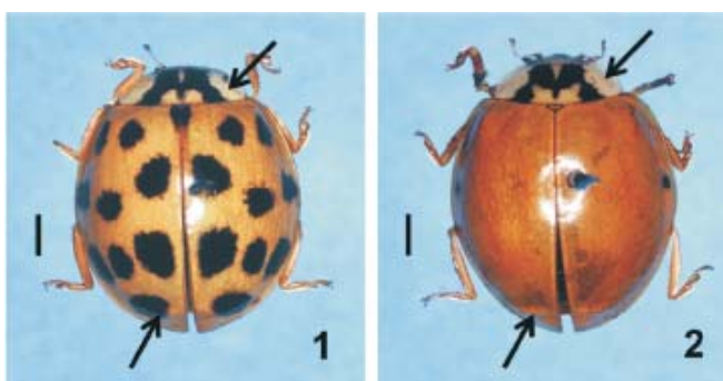
The extremes of colour variation in adult harlequin lady beetles

There is international interest in this phenomenon, and the harlequin is seen as a 'model species' of invasion biology and of biocontrol that went crooked. At the forthcoming International Congress of Entomology (Durban, July 2008) a whole symposium will be dedicated to this nasty beast.