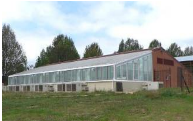
The new, state-of-the-art quarantine facility at Cedara

The building has a total floor area of 20 x 30 m, most of which falls within quarantine. The quarantine area consists of four north-facing glasshouse rooms, two of 8 x 8 m and two of 8 x 4 m, for culturing and testing insects within cages, on potted plants. Within the glasshouse space there is also a small room for spraying plants with pesticides, and a holding room for keeping these plants until the pesticides have taken effect. The entire glasshouse area is protected by double glazed (to minimize the chances of escape of insects, as well as for better insulation), non-laminated (to minimize the exclusion of any wavelengths of light which might be needed by plants and insects for growth and development or mating cues respectively) glass in a steel and aluminium frame. Humidity is increased to around 70% RH in the glasshouse rooms via high-pressure nozzles mounted in the glasshouse, which introduce atomized, de-ionized water. The temperature of each glasshouse can be individually set, and varies on a 24 hour day-night cycle between 20 and 30°C.