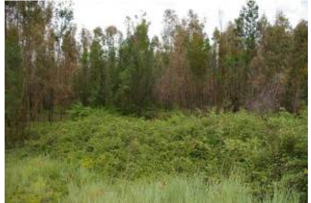
Rubus xproteus — an infestation between Machadodorp and Badplaas (above); pinnate/palmate leaves indicate that it is alien; short pink petals and non-prickly inflorescence distinguish it from R. fruticosus . These photos show just one combination of features exhibited by R. xproteus .

The parent species of R. xproteus can be separated mainly on inflorescence length, petal length and colour, and whether the leaves on the primocane (first-year cane of vegetative growth/non-flowering) are pinnate or pinnate/palmate. Another alien species that may be mistaken for the hybrid is R. fruticosus , which usually can be distinguished by the combination of large petals and much-branched, very prickly inflorescences up to 200 mm long situated terminally (at the stem tips) (pers. comm. C.H. Stirton).