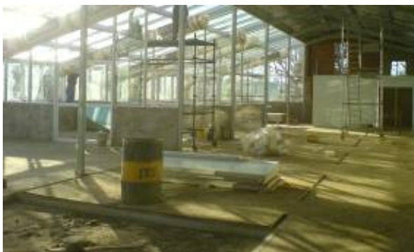
Cedara quarantine facility under construction

Work started late in 2006 and was largely completed by late 2007. The Directorate: Plant Health of the Department of Agriculture inspected the building and granted ARC a quarantine permit early in 2008. The building was equipped and the first insects were moved in during late February 2008. The final cost of the entire building project has been around R8.4 million.