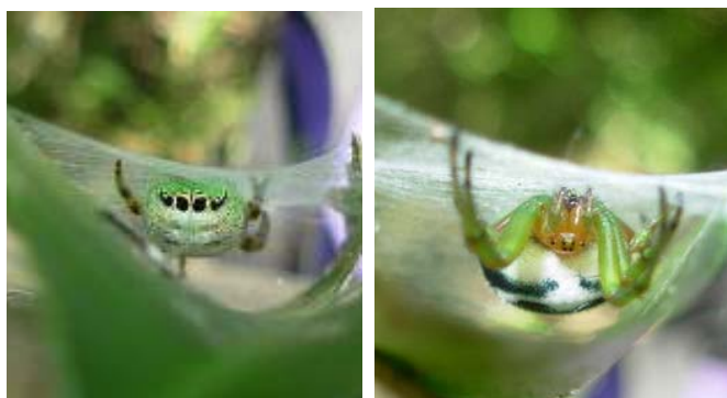
Araneus legonensis was originally described from Ghana in West Africa, but as part of SANSA surveys was collected on the Soutpansberg in the Limpopo Province, and at Helsing and Hilton in KwaZulu-Natal