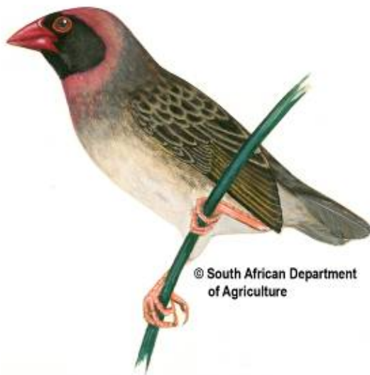
Redbilled Quelea, ♂

For those who are not familiar with Redbilled Quelea ( Quelea quelea sp.) (Fig. 1), this bird species is an agriculturally important migratory pest to small grain crop-producing farmers of southern Africa comprising South Africa, Zimbabwe, Botswana, Mozambique and other neighbouring Southern African Development Community (SADC) countries. Redbilled quelea are highly nomadic, with complex migration patterns in southern Africa that are dictated by changes in seed availability which, in turn, are driven by changes in rainfall patterns. They are extremely sociable birds, and feed, drink, roost, and breed in large flocks. The quelea found in southern Africa reach plague proportions in agricultural crop areas 1 at certain seasons and can have severe economic impacts by causing extensive damage to food crops such as wheat, sorghum, manna, and millet. The feeding behaviour of the large flocks of Redbilled Quelea birds can result in significant crop losses to commercial and subsistence small grain farmers and severely affect food security.