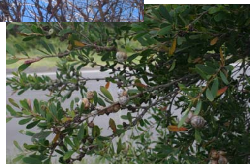
Large cecidomyiid galls on Australian myrtle