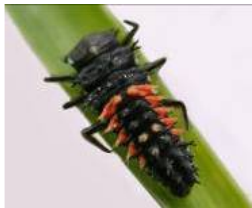
Late-instar larva of the harlequin lady beetle

Handling them may lead to them secreting a noxious fluid which may stain walls and fabric. And—injury upon insult—the harlequin can be bad for your health!