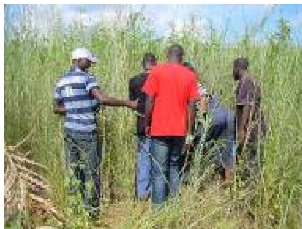
Part of the rodent team in the field