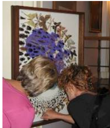
Insect spiral from ARC-PPRI