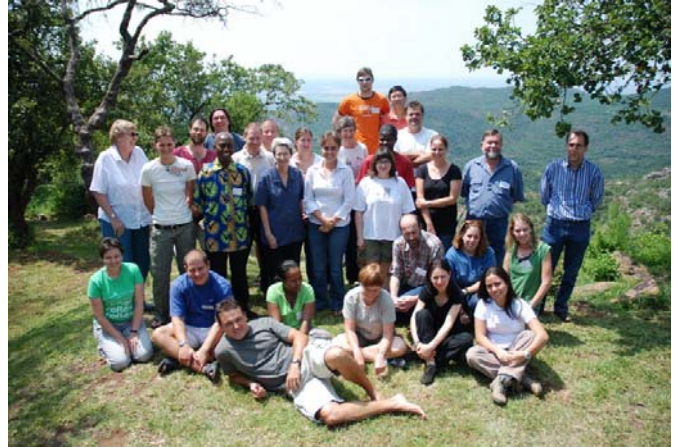
Delegates of the 9th African Arachnological Colloquium