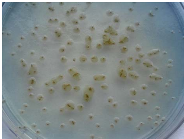
Colonies of a new bacterial species, Pantoea allii , on a semi-selective medium PA20.