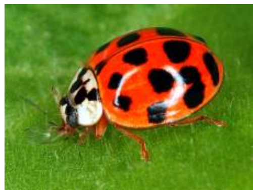
Adult harlequin feeding on an aphid

Then the harlequin moves into your house, forming large, unwanted overwintering aggregations.