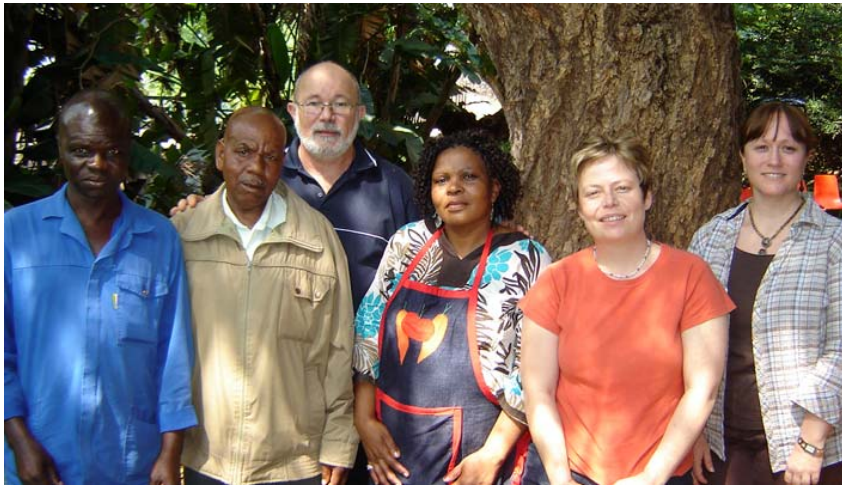
The Virology group