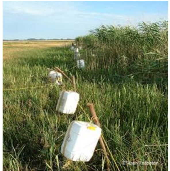
Layout for ground-based fuel-air explosion control in a wetland area: 20-litre plastic drums containing fuel are spaced at 7–10 m intervals depending on the density of the foliage of the roosting and/or breeding site. Individual drums are connected with detonation cord, and the fuel is detonated using boosters and detonation fuses

Quelea control is undertaken for crop protection. Although various alternative methods of quelea control have been investigated in South Africa, the most successful methods remain (a) chemical control by aerial application of an organophosphate avicide (terrestrial habitat), and (b) ground-based fuel-air explosion control (terrestrial and aquatic habitat).