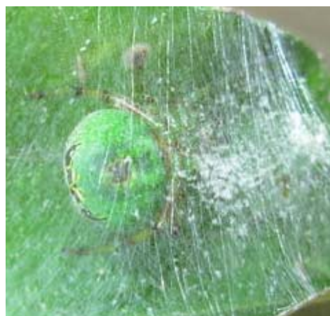
John Roff photographed this interesting spider at Hilton in KwaZulu-Natal. The markings on the abdomen are very unusual, and when the spider is in its retreat it resembles the eye patterns of certain salticid genera (e.g. Thyene )